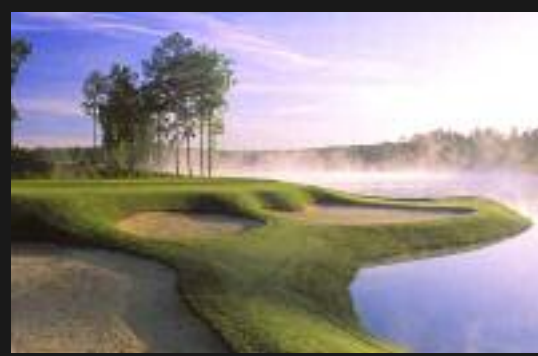
Woodside Plantation Country Club - this private and gated golf course boasts two Championship courses designed by Rees Jones and Bob Cupp. It covers more than 2,900 acres of beautifully rolling countryside in the historic city of Aiken, SC.