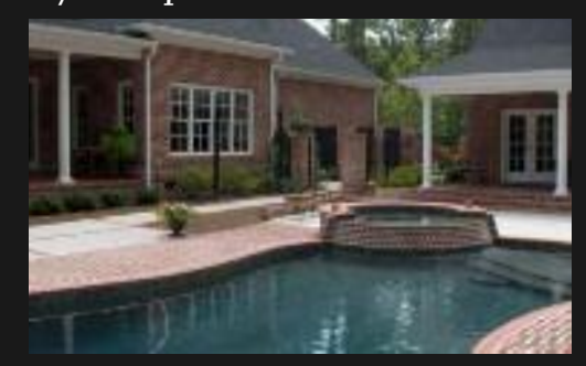
Outdoor pool & hot tub