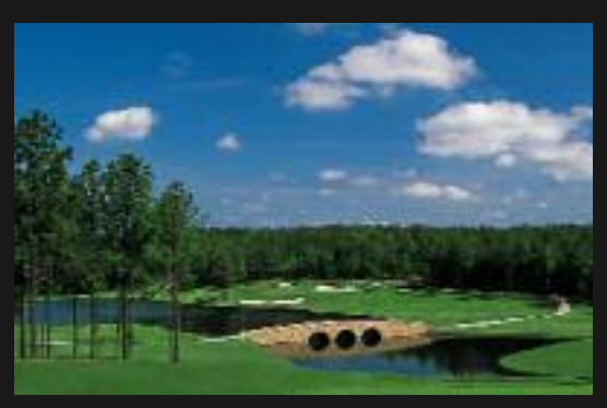
Mount Vintage Plantation Golf Club - a 27-hole championship golf course which has been likened to the Augusta National by Golf Magazine. It is challenging for the most serious golfer and breathtakingly beautiful.