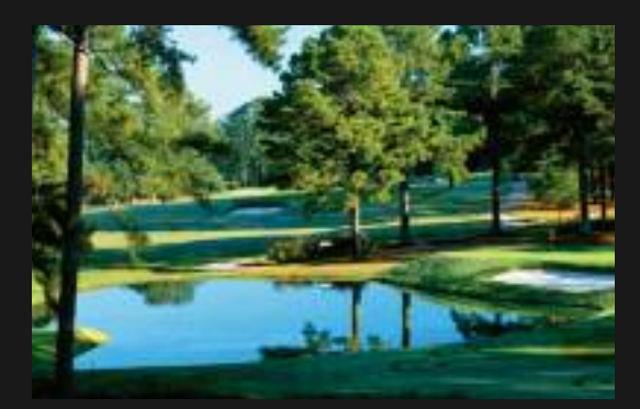
Augusta Country Club - sharing a fence, a creek and a valley with Augusta National, this recently re-mastered Donald Ross course features 6,771 yards of golf from the longest tees for a par of 72.