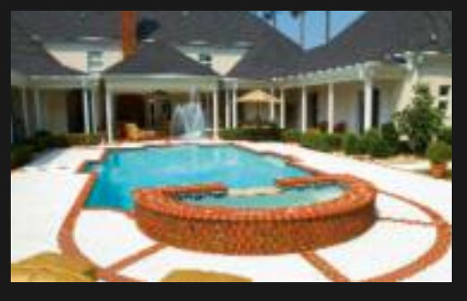
Outdoor heated pool

This stunning four-bedroom house is arguably one of the finest houses available to rent and is situated in Barrington, no more than 15 minutes from Augusta National. The house occupies a corner plot and is very private and beautifully appointed. The stunning outdoor swimming pool offers a covered seating area and fire pit. The house also has its own cinema room complete with popcorn machine plus a games room with pool table, jukebox and Vintage Coca-Cola cooler. The dining table seats ten and if you wish, we can even find a pianist to play while you are served dinner by your personal chef.