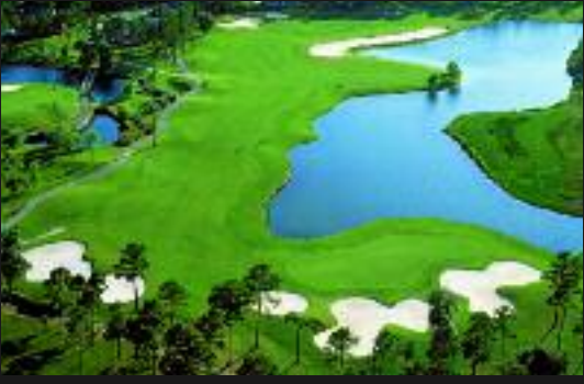
The River Club – combines a fantastic layout with a spectacular setting to create a golfer's paradise. Designed by acclaimed golf architect, Jim Fazio, the course features 6,847 yards of golf from the longest tees for a par of 71.