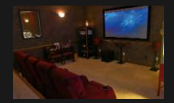
Home cinema room