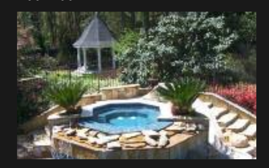
Outdoor hot tub